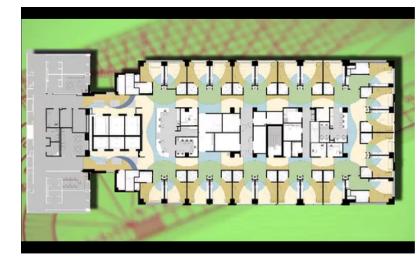
Figure 1. South Patient Tower floor plan

SIPS is a highly detailed method to schedule a repetitive construction projet. The South Patient Tower inclue 174 private intensive care and medical/surgical patient rooms for a total of 236,000 square feet. The floor plans are relatively repeatable. So SIPS is considered as a potential solution to the problem. The probability of the implementation of SIPS still need to be further studied and researched.